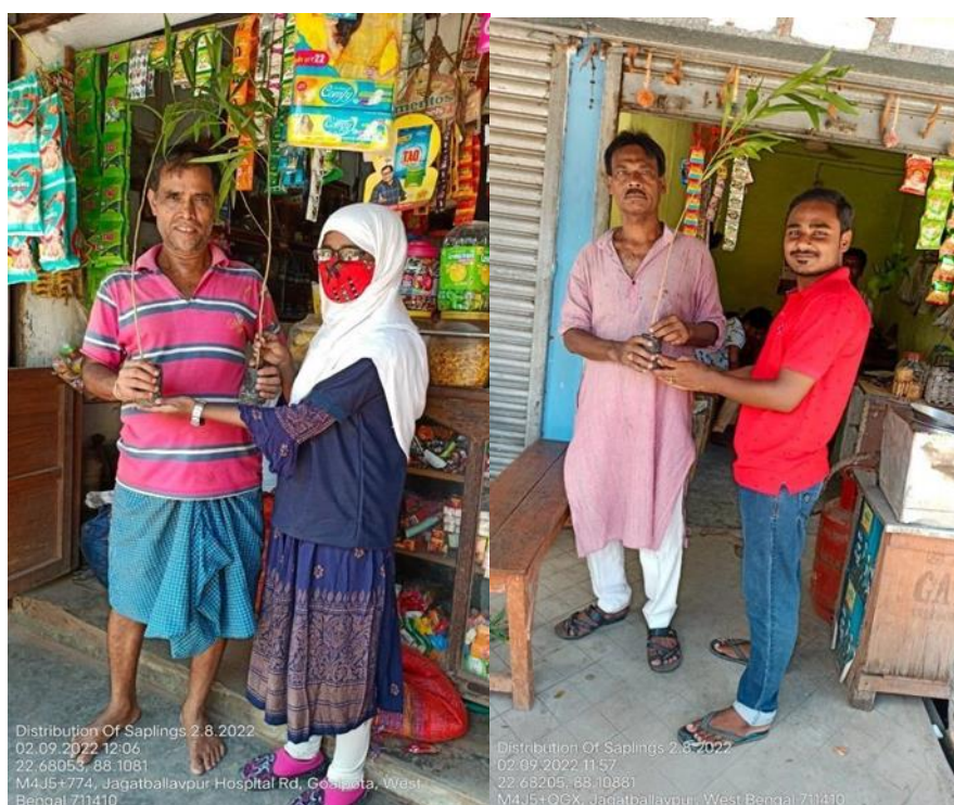
Distribution of plant saplings to local people/inhabitants near college dated 02.09.2022

This extension activity was organised by the Department of Botany, NSS Unit and IQAC of the college. They visited a school at Munsirhat and took the students of class VIII around the locality to help them connect with nature and identify some locally grown plants.