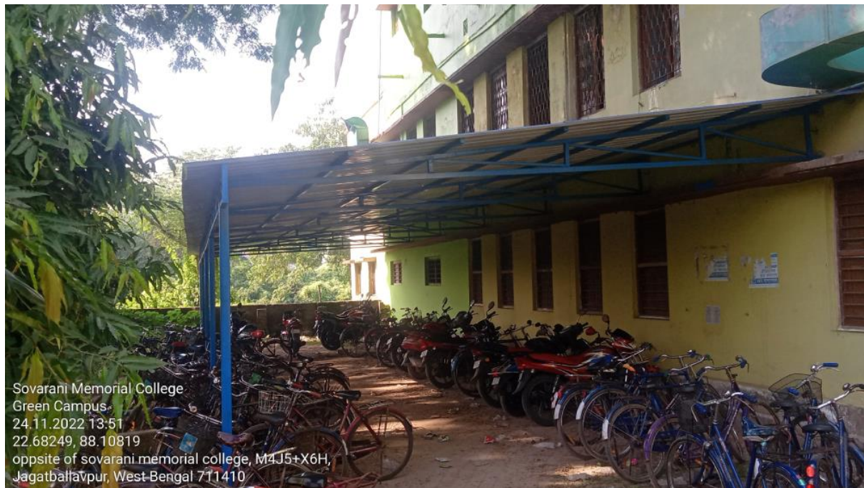
College Cycle stand: Students and Staffs are encouraged to commute by cycle which is eco friendly