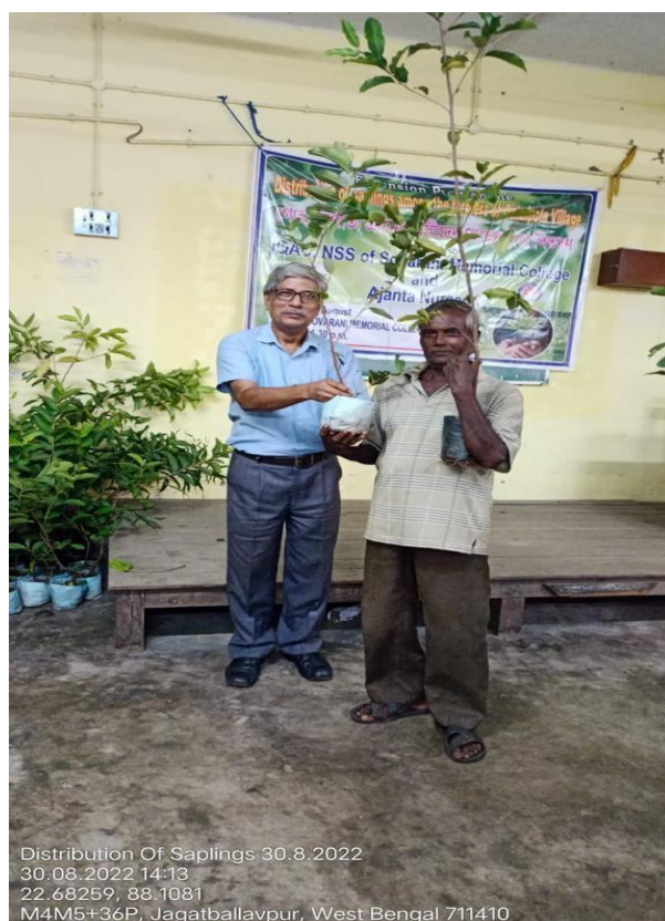
Distribution of saplings among farmers of Goalpota village dated 30.08.2022

The extension programme was organized on 30.08.2022 by the IQAC, the NSS-Unit of the college and Ajanta Nursery. Farmers of Goalpota village were invited to receive saplings of plants such as jamun, sirish, guava, etc. for their houses and fields. The programme was aimed at encouraging more plantation in the household and field levels.