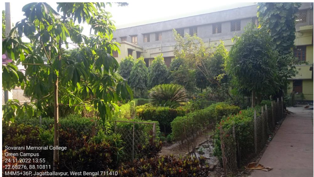
Greenery within the College Campus: Landscaping with trees and plants