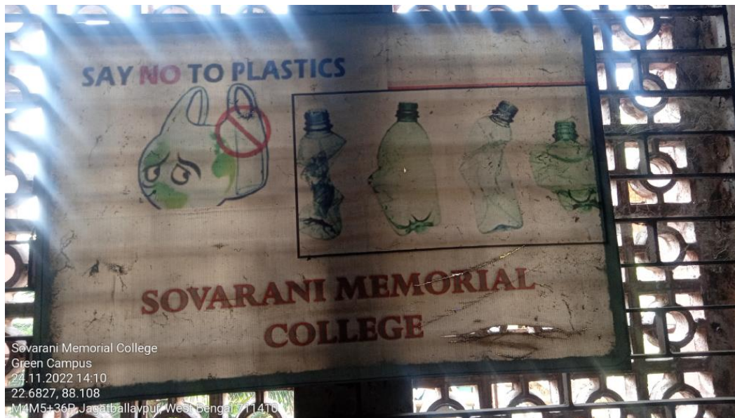
Posters within the College Campus: Ban on use of plastic