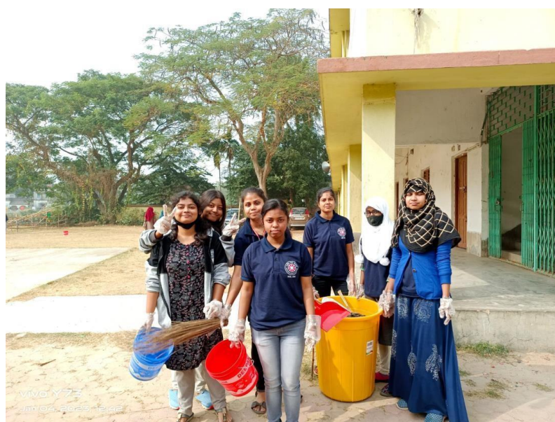
College Campus Cleaning initiatives