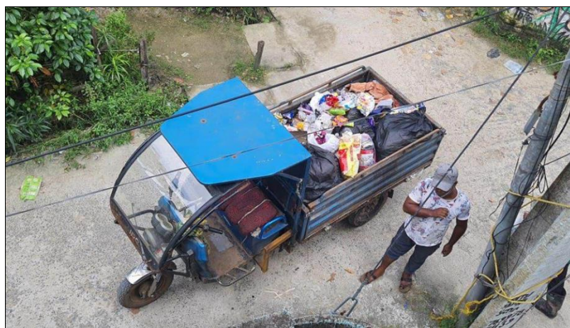
COLLEGE WASTE DISPOSAL BY PANCHAYET