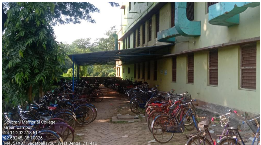
College Cycle stand.

Students and Staffs are encouraged to use cycle for daily commutation