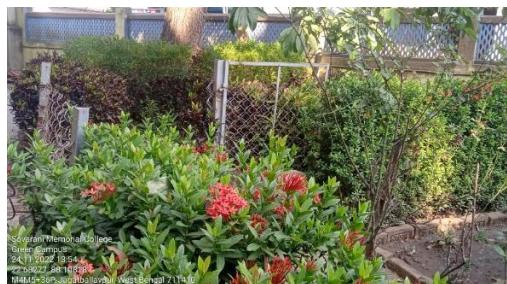
Picture of the Greenery in College Campus