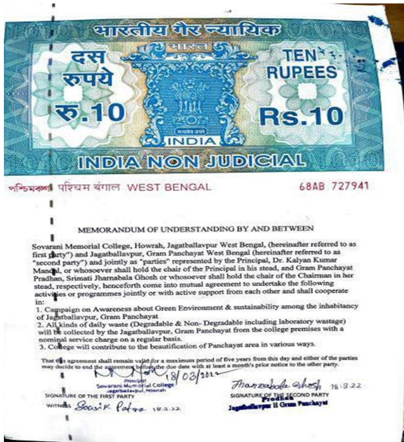
MoU with Jagatballavpur Gram Panchayat