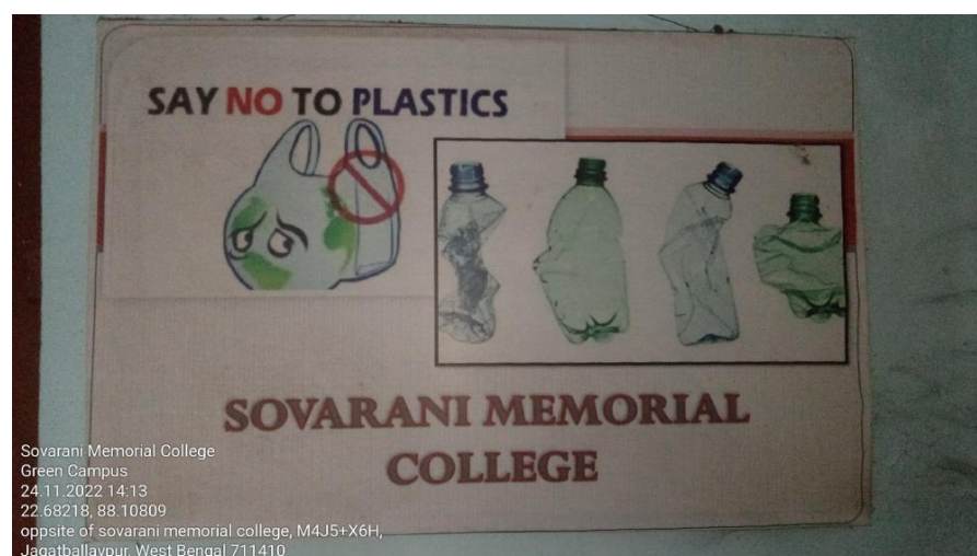
Posters to make the Campus Plastics free