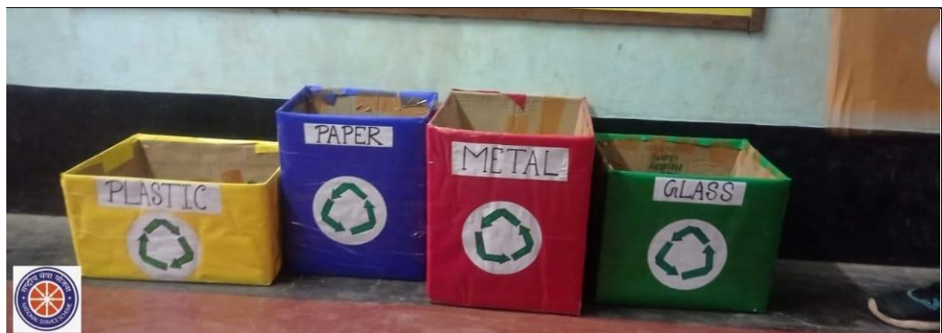
NSS Unit of the College spread awareness regarding degradable and non-degradable waste management