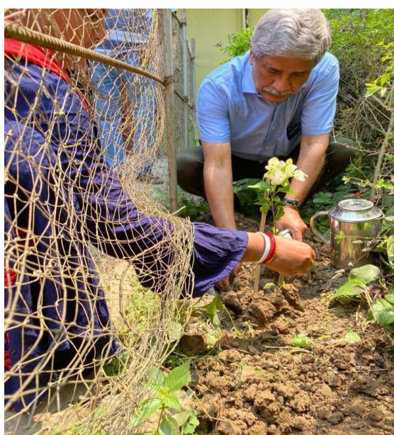
Regular Tree Plantation programs undertaken in the College Campus