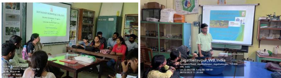
Classrooms with ICT facilities