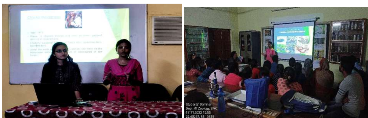
Student's seminar using ICT tools