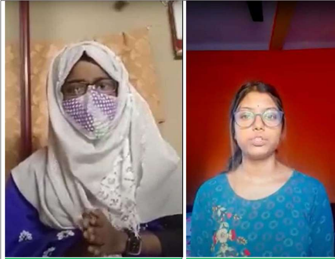
Screenshots of NSS volunteers sharing messages and importance of Independence Day