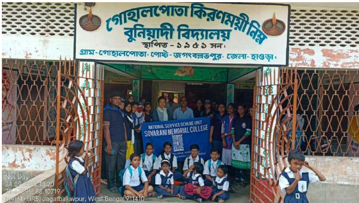
13. Demonstration of handwashing and maintenance of hygiene to school children (A part of Outreach programme on NSS Day celebration dated 24.09.2022)