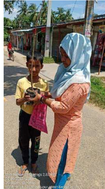
Distribution Of Saplings 2.8.2022 02.09.2022 12:20 27.6929, 88.10836 M4M5+59C, Jagatballavpur, West Bengal 711410