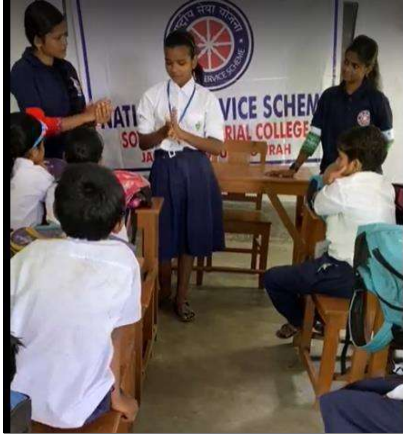
Students being demonstrated proper handwashing method