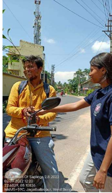
Distribution Of Saplings 2.8.2022 02.09.2022 12:20 27.6929, 88.10836 M4M5+59C, Jagatballavpur, West Bengal 711410