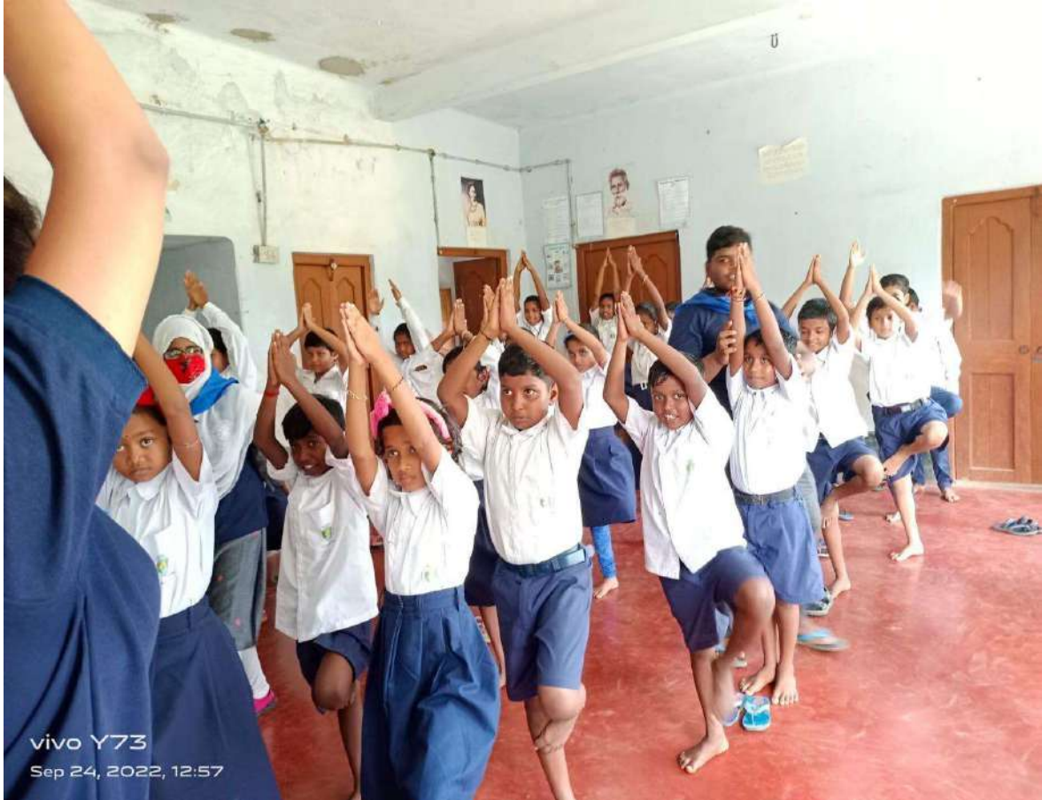
Interactive physical fitness session for school students

15. Teaching of 'Smart Mathematical Tricks' (A part of Outreach programme on NSS Day celebration dated 24.09.2022)