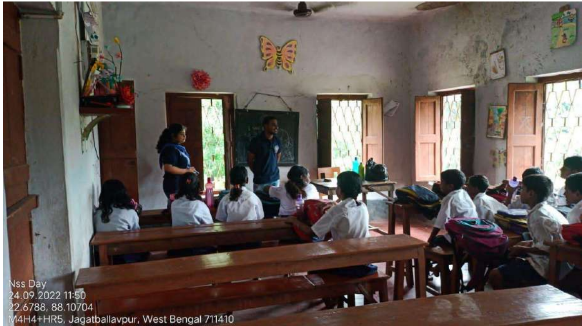
NSS volunteers imparting smart tricks to make Mathematics fun for students