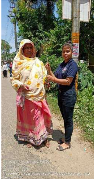
Distribution Of Saplings 2.8.2022 02.09.2022 12:20 27.6929, 88.10836 M4M5+59C, Jagatballavpur, West Bengal 711410