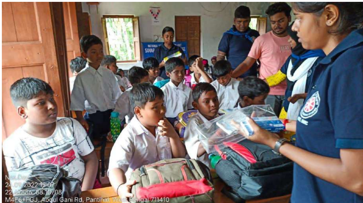
NSS volunteers distributing stationeries to school children