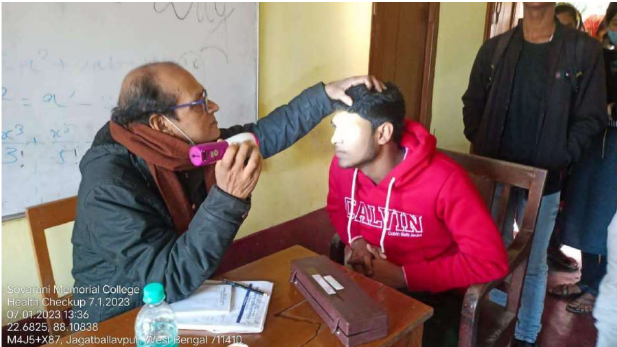
Sovarani Memorial College Health Checkup 7.1.2023 07.01.2023 13:36 22.6825, 88.10838 M4J5+X87, Jagatballavpur, West Bengal 711410