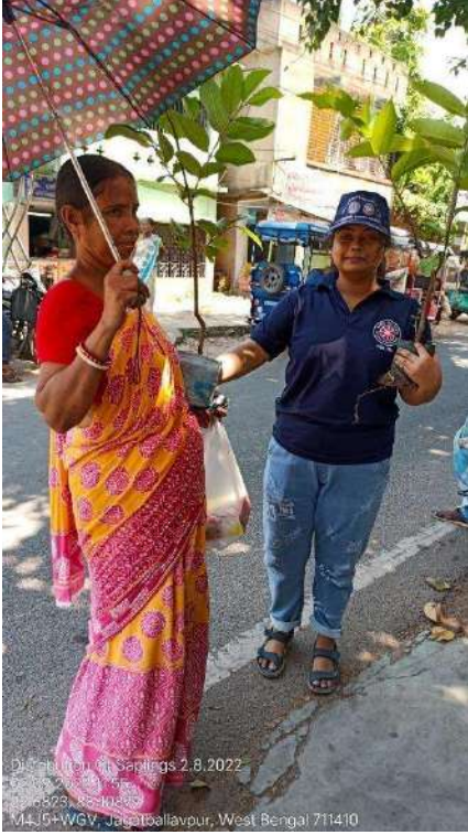
Distribution Of Saplings 2.8.2022 02.09.2022 12:20 27.6929, 88.10836 M4M5+59C, Jagatballavpur, West Bengal 711410