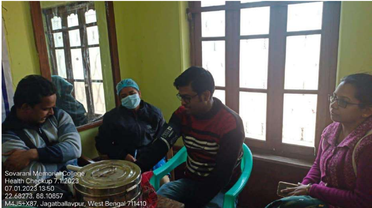
Sovarani Memorial College Health Checkup 7.1.2023 07.01.2023 13:50 22.68273, 88.10857 M4J5+X87, Jagatballavpur, West Bengal 711410